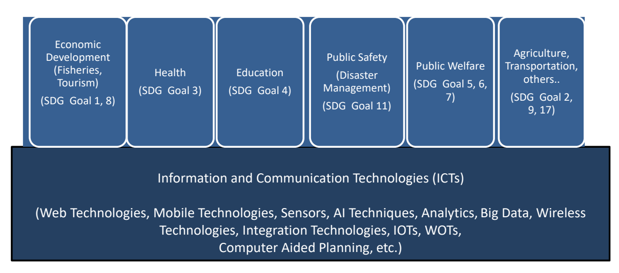
Figure 2: How the ICTs can Impact Different Sectors and SDGs

ICTs and digital innovations can have a profound impact on SDGs as documented in major reports, conferences, and websites sponsored by Cisco, Ericsson, the International Telecommunications Union (ITU), the United Nations, Columbia University, the World Bank and others [3, 4, 5, 9, 10, 11]. Figure 2 illustrates how the wide range of ICT services cut across all sectors of value to the SIDS instead of one sector. The technologies include Web Technologies, Mobile Technologies, Sensors, Artificial Intelligence Techniques, Analytics, Big Data, Wireless Technologies, Integration Technologies, IOTs (Internet of Things), WOTs (Web of Things), and Computer Aided Planning Tools. Figure 2 also shows the specific sustainable development goals that are supported by these technologies in sectors such as economic development, health, education, public safety, public welfare, agriculture, transportation and others. A more detailed view of how different digital technologies can support the 17 SDGs is shown in Table1.