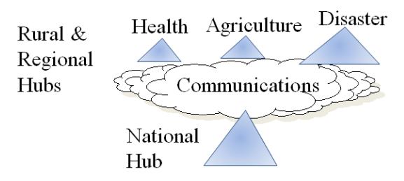
Figure1: Basic Vision of ICT Hubs as Proposed by the Samoa Pathway

related services at all levels. In addition, the objective of ICT4SIDS Partnership is to support these collaborating ICT hubs as shown in Figure 1.